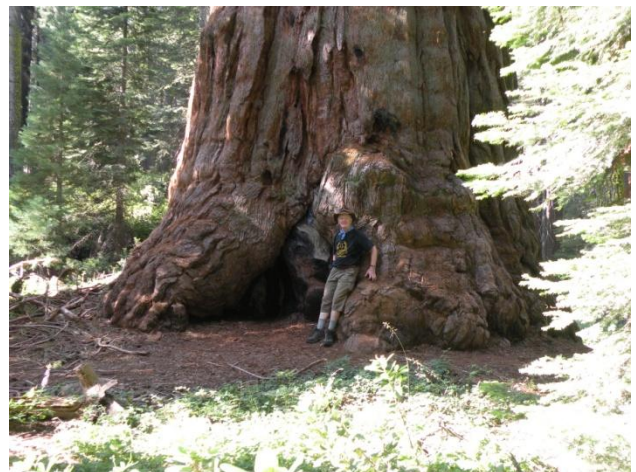
- Craig Thompson at the base of a Giant Sequoia

There are now 75 Giant Sequoia groves, all in California, covering just over 35,000 acres and scattered along a 260 mile stretch in the Sierra Nevada at elevations of between 5000 and 7000 feet. They inhabit moist sites that have annual precipitation of between 45 and 60 inches, most of it coming from winter snows from November through April.