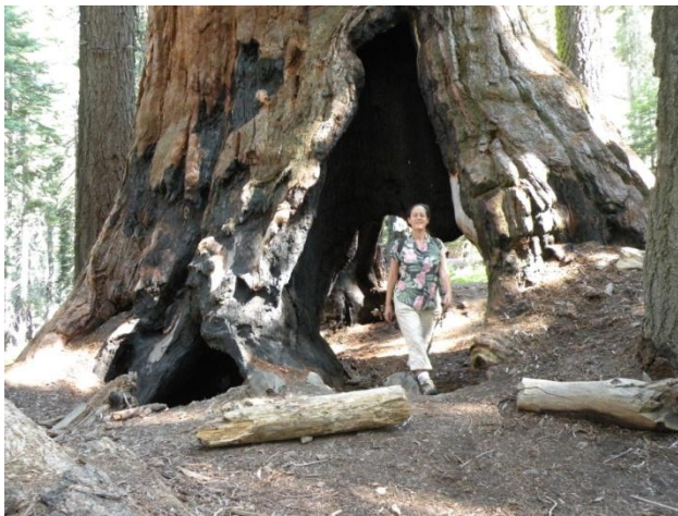
- Example of hollowed out Sequoia

Why do these trees live so long? The oldest recorded age is 3500 years (although this one was figured out by counting the rings on a stump). The oldest living Giant Sequoia is the General Sherman in Sequoia National Park, at 2800 years old. This is also the largest tree in the world. Giant Sequoias are very well adapted to their environment. Fire doesn't kill them, as they have very thick bark and chemical tannins that protect the live wood underneath. Just look at almost any large, old sequoia. They usually have fire scars and many have hollowed out trunks in which you can stand in. These hollows have been carved out by many, many fires. But the tree lives on.