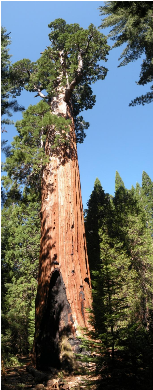
- A really big Giant Sequoia

As California residents and tree lovers, we are quite lucky. Within the span of a few hundred miles we have the tallest (Coast Redwood), the oldest (Bristlecone Pine) and the largest (Giant Sequoia) trees in the world. Imagine that! And all three are great inspirations to us as bonsai artists.