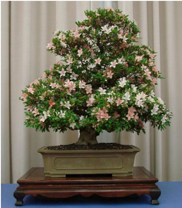
Beautiful azalea bonsai at BASA show June 2010

Generally, Satsuki azaleas, which were developed in Japan, fall into two growing groups. Those developed in the northern part of Japan thrive in cooler climates and will require different exposure in your garden and have different watering requirements than those developed in southern Japan. It is important to find out which variety your Satsuki is so you can give it the optimal growing conditions.